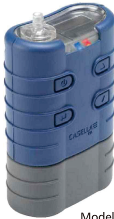
Model : TUFF